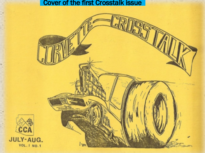
Cover of the first Crosstalk issue